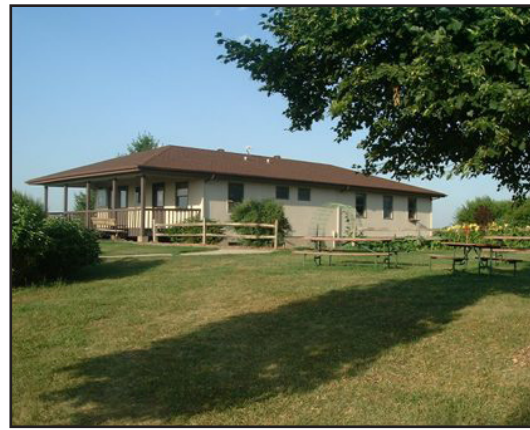
Nature Center at Anderson Conservation Area