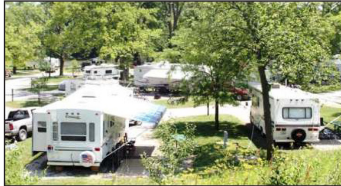
Camping at Pilot Grove