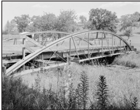
Historic Bridge at Pilot Grove Park